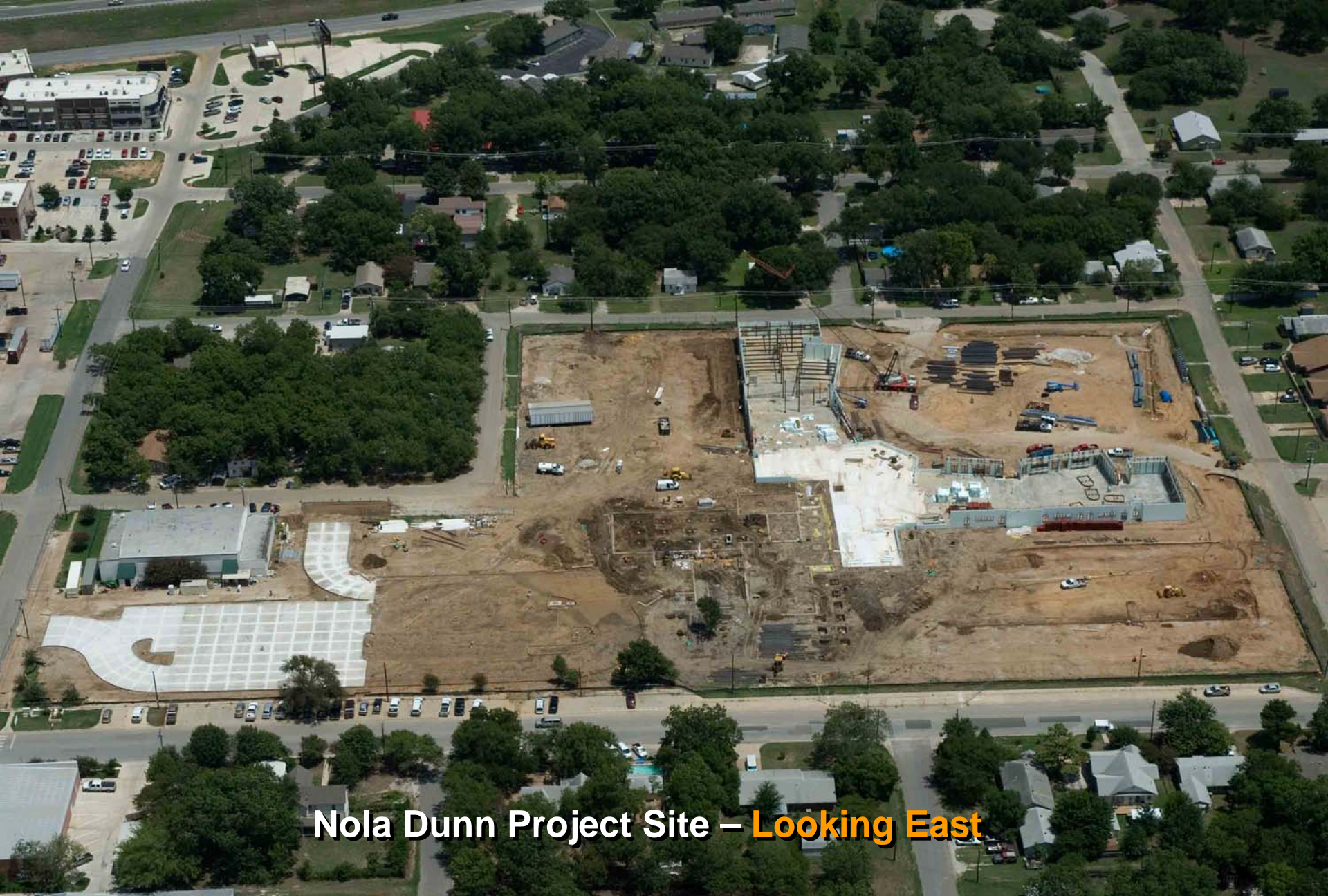
Nola Dunn Project Site – Looking East