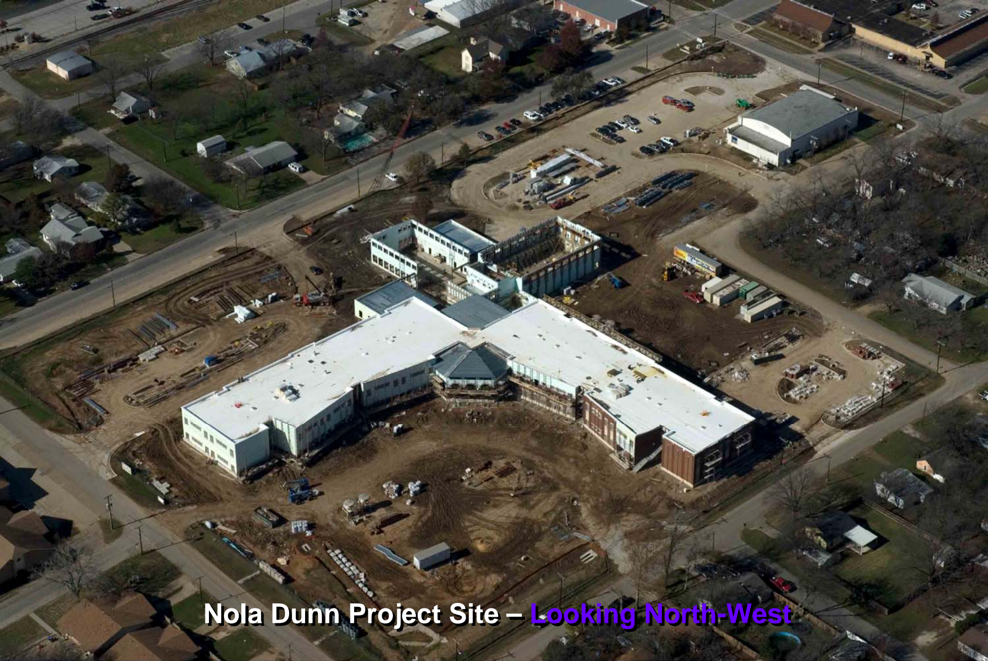
Nola Dunn Project Site – Looking North-West