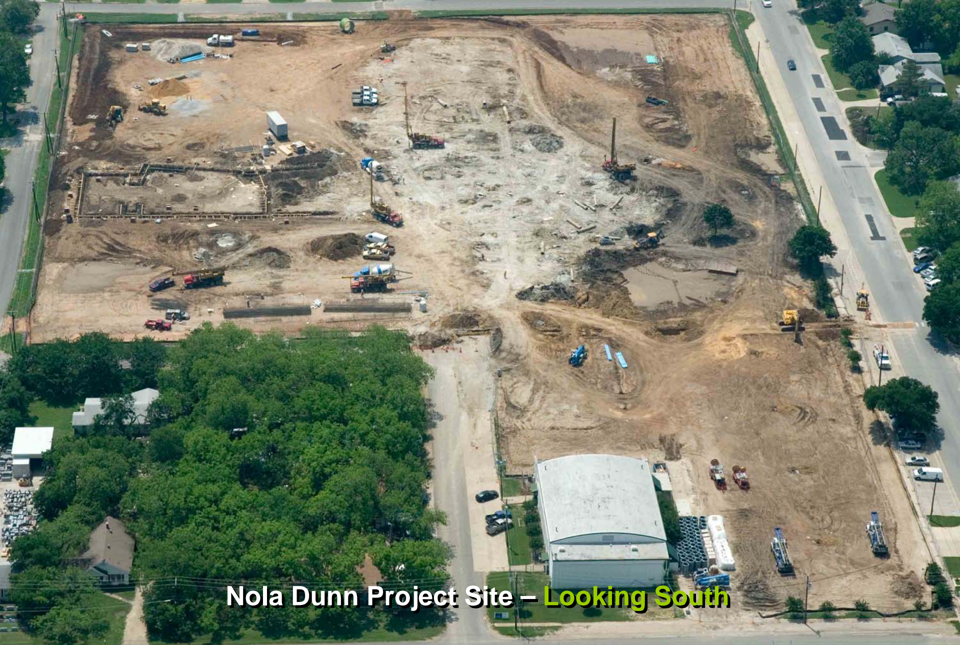
Nola Dunn Project Site – Looking South