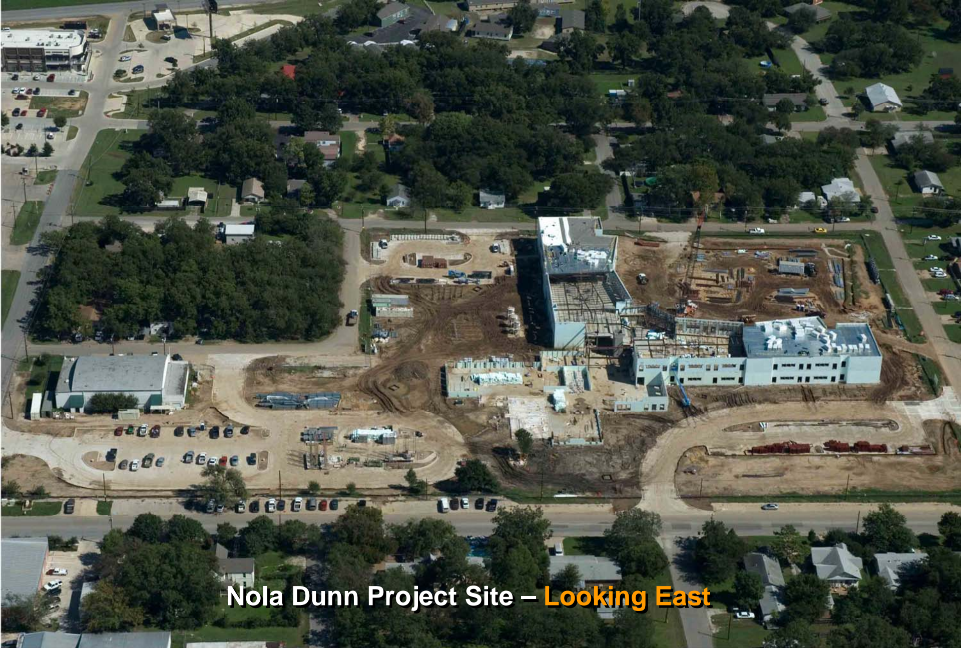
Nola Dunn Project Site – Looking East