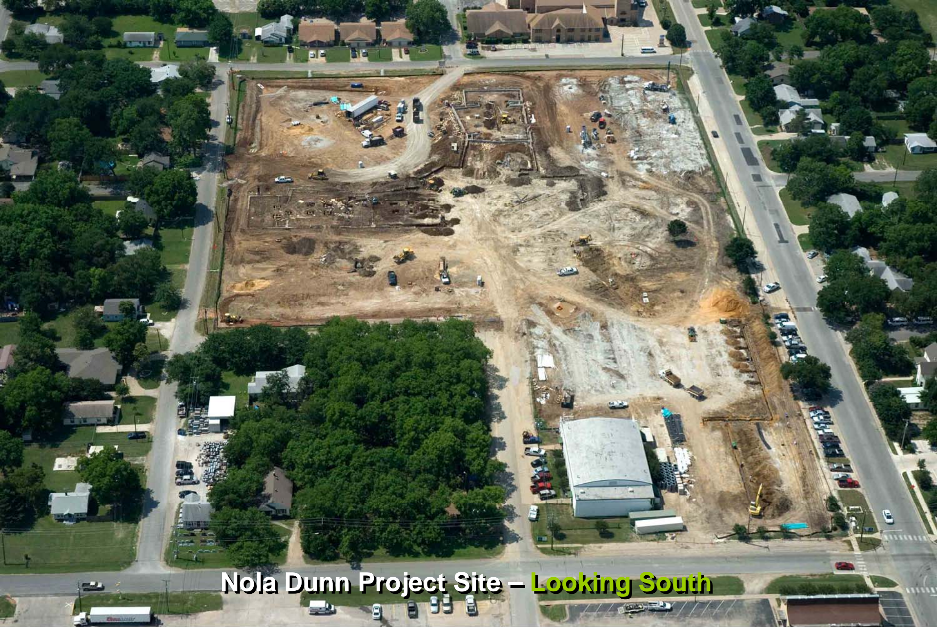
Nola Dunn Project Site – Looking South