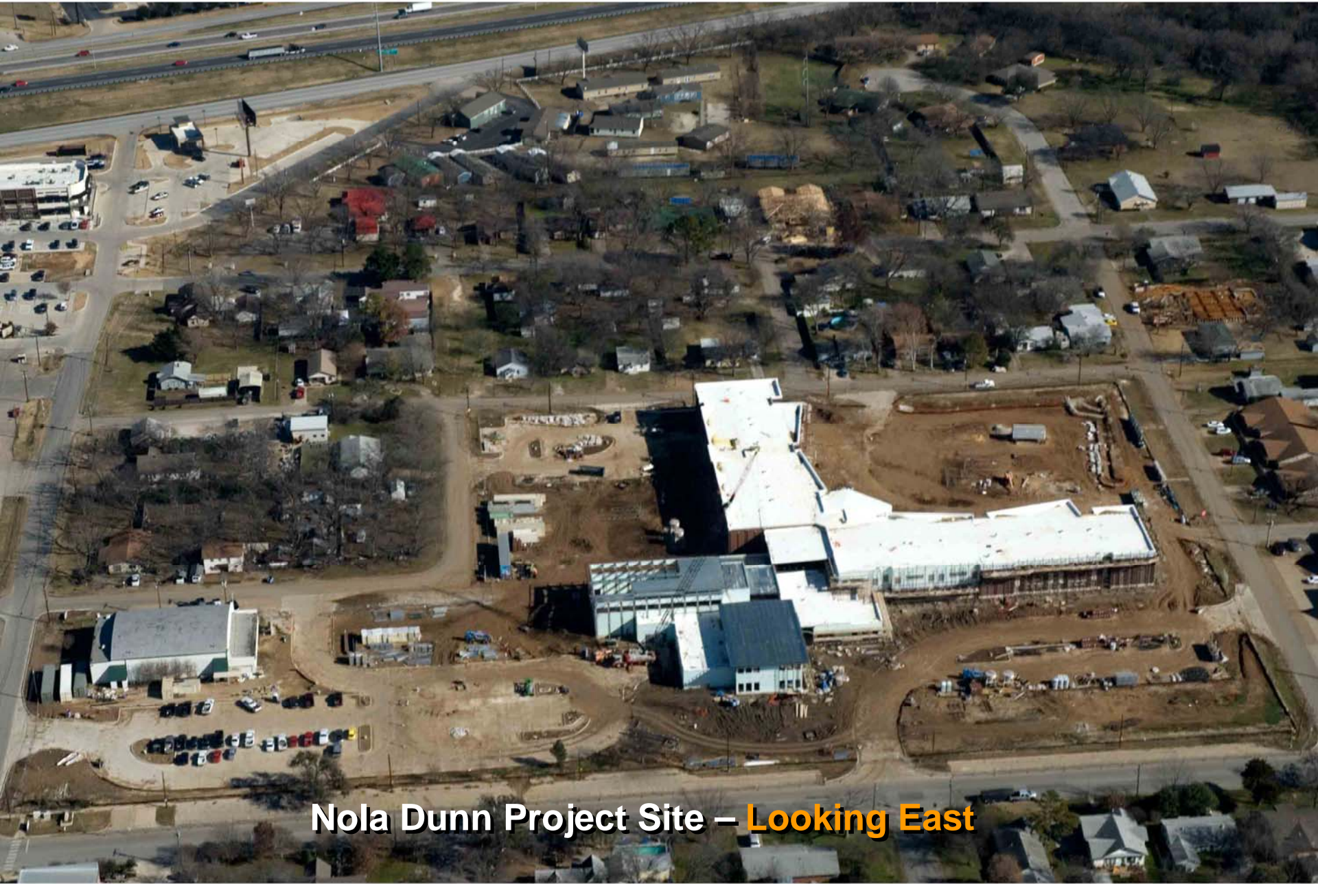
Nola Dunn Project Site – Looking East