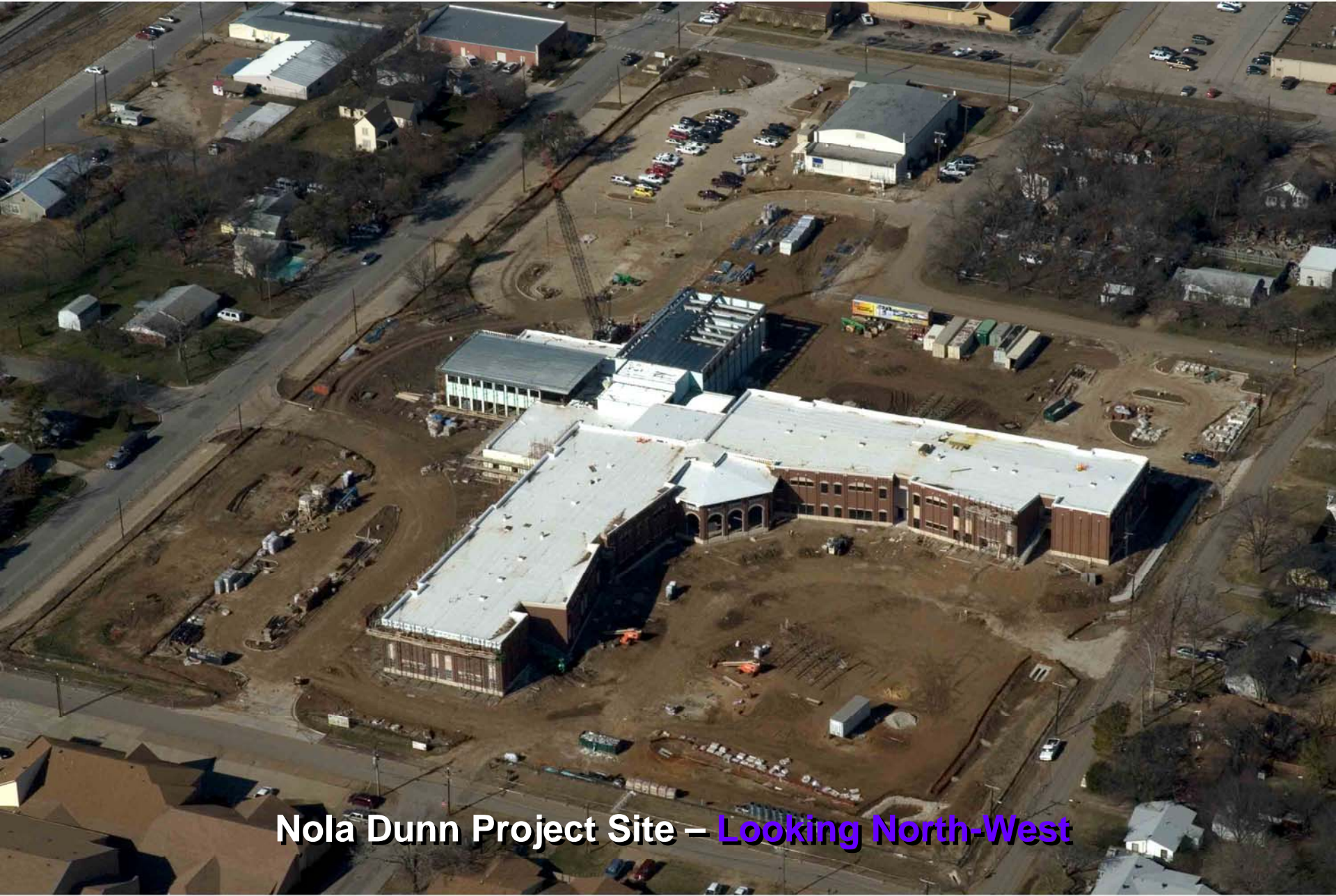
Nola Dunn Project Site – Looking North-West