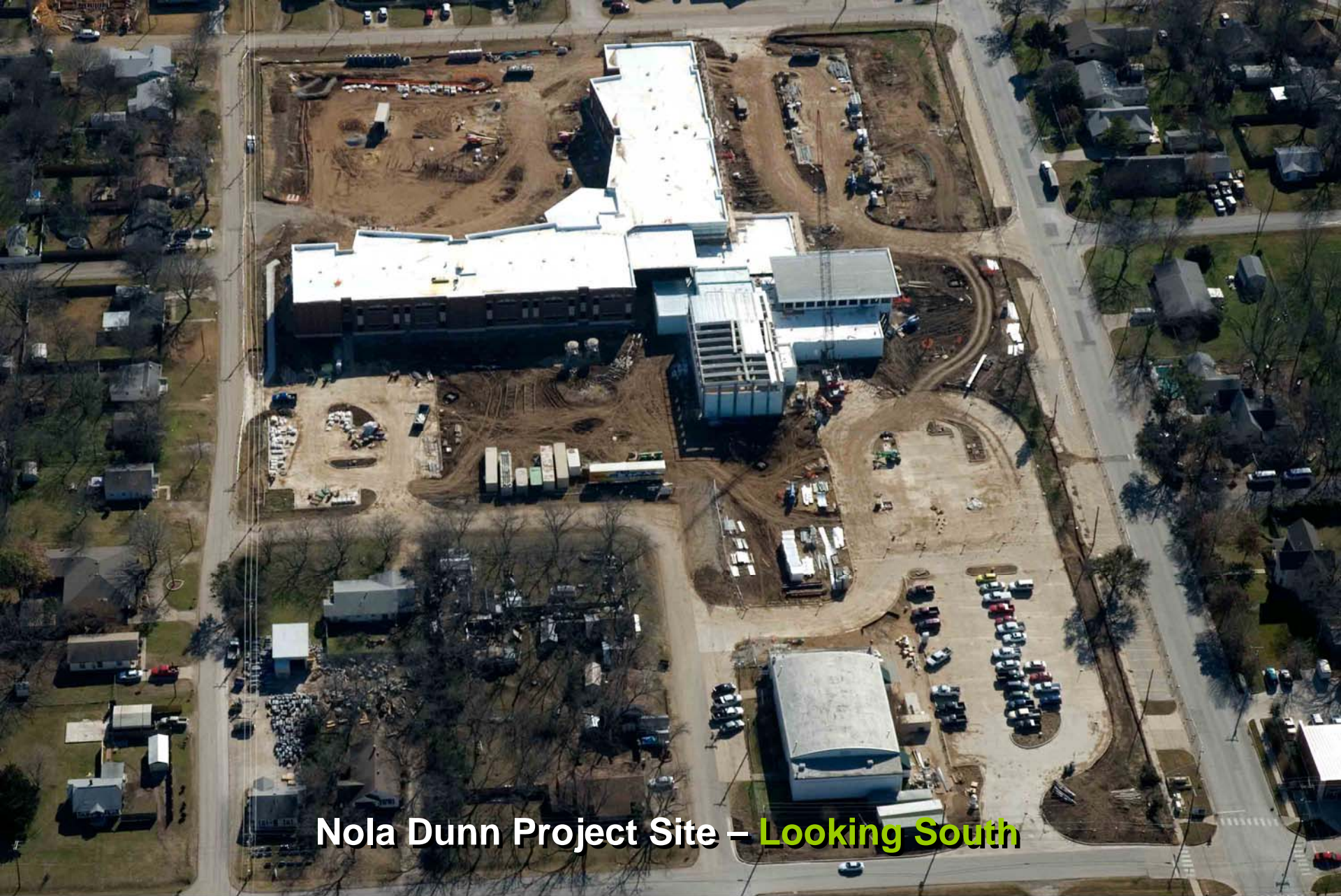
Nola Dunn Project Site – Looking South