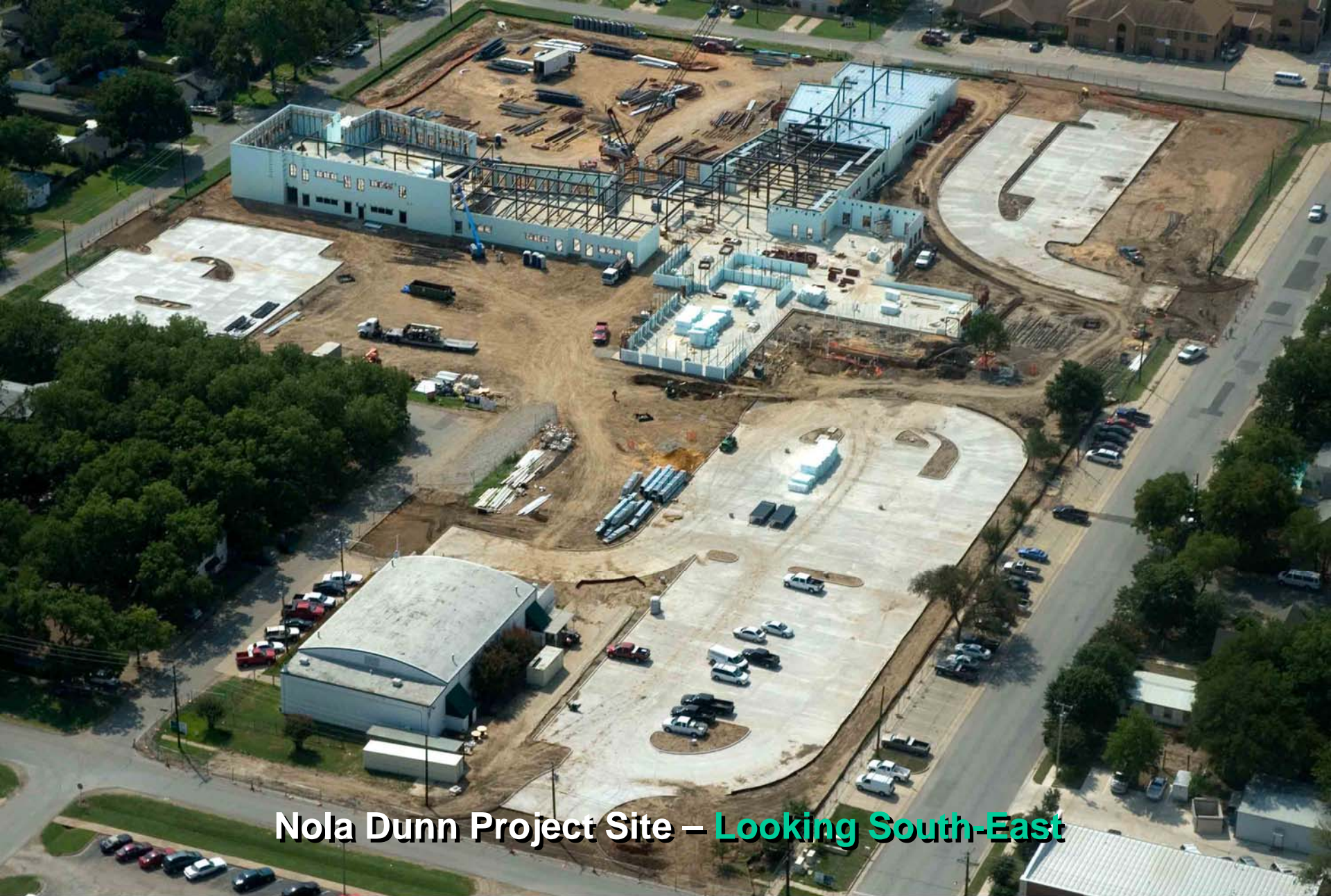
Nola Dunn Project Site – Looking South-East