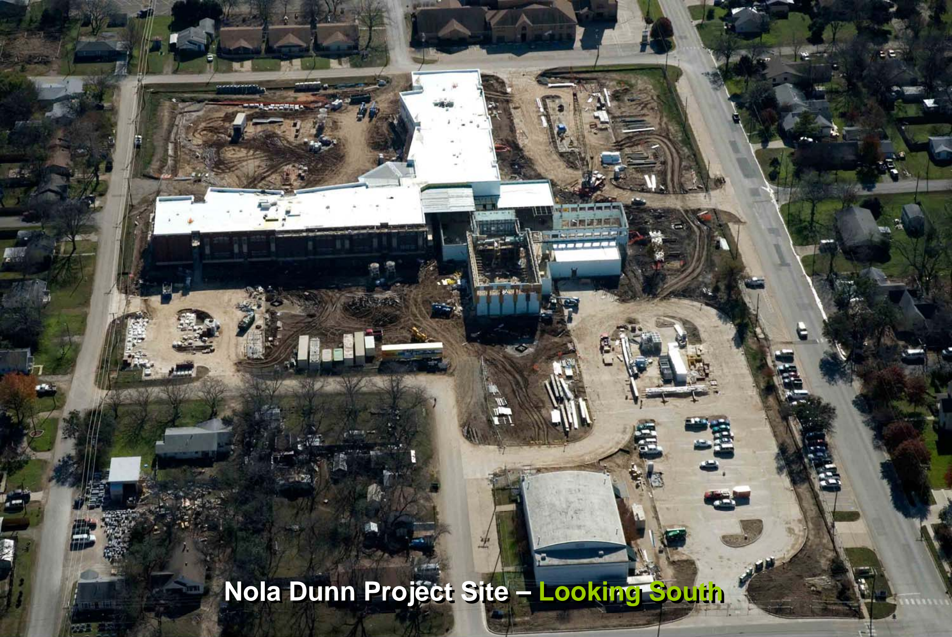
Nola Dunn Project Site – Looking South