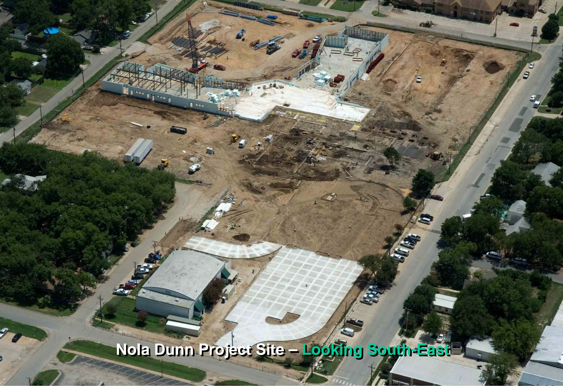
Nola Dunn Project Site – Looking South-East