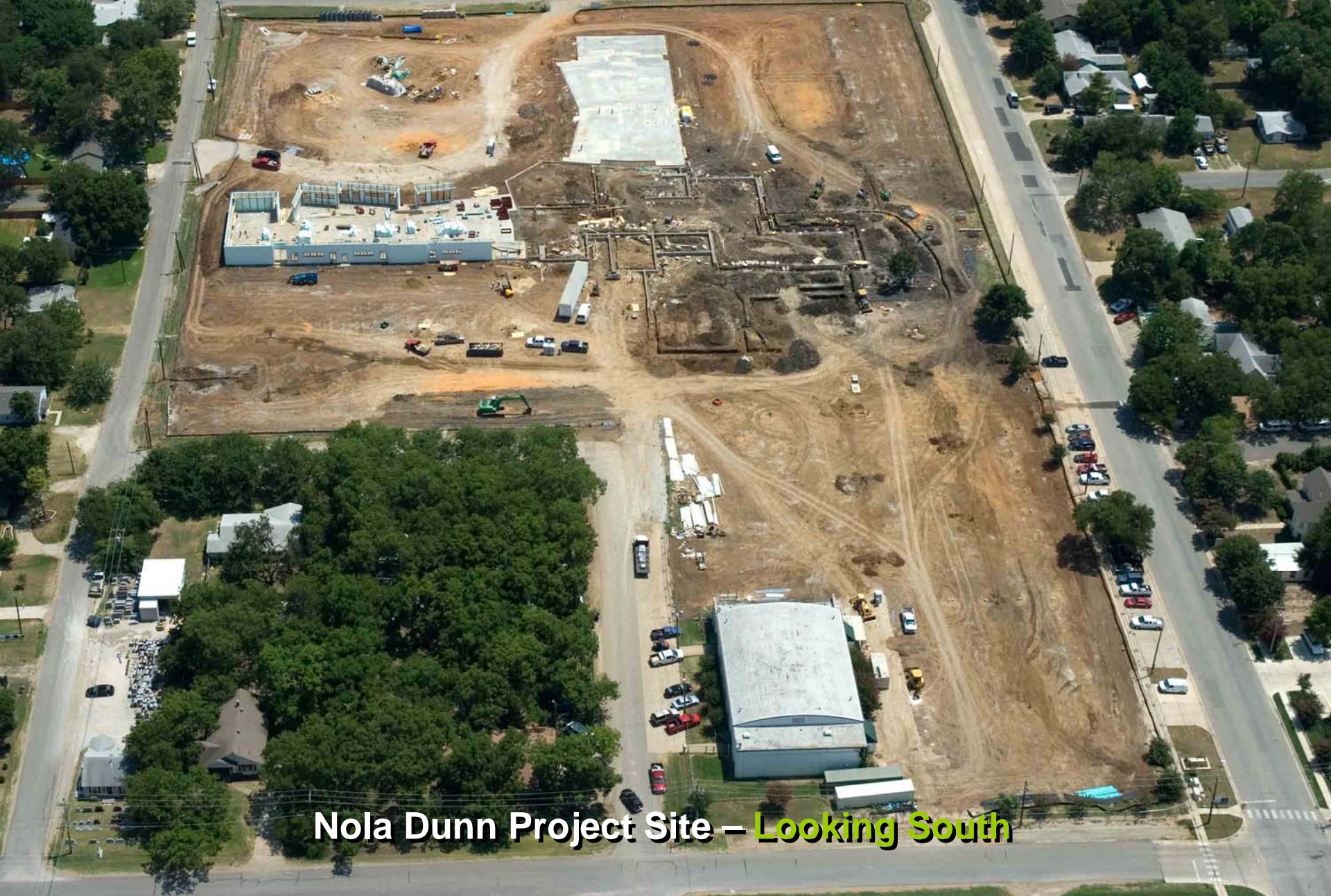
Nola Dunn Project Site – Looking South