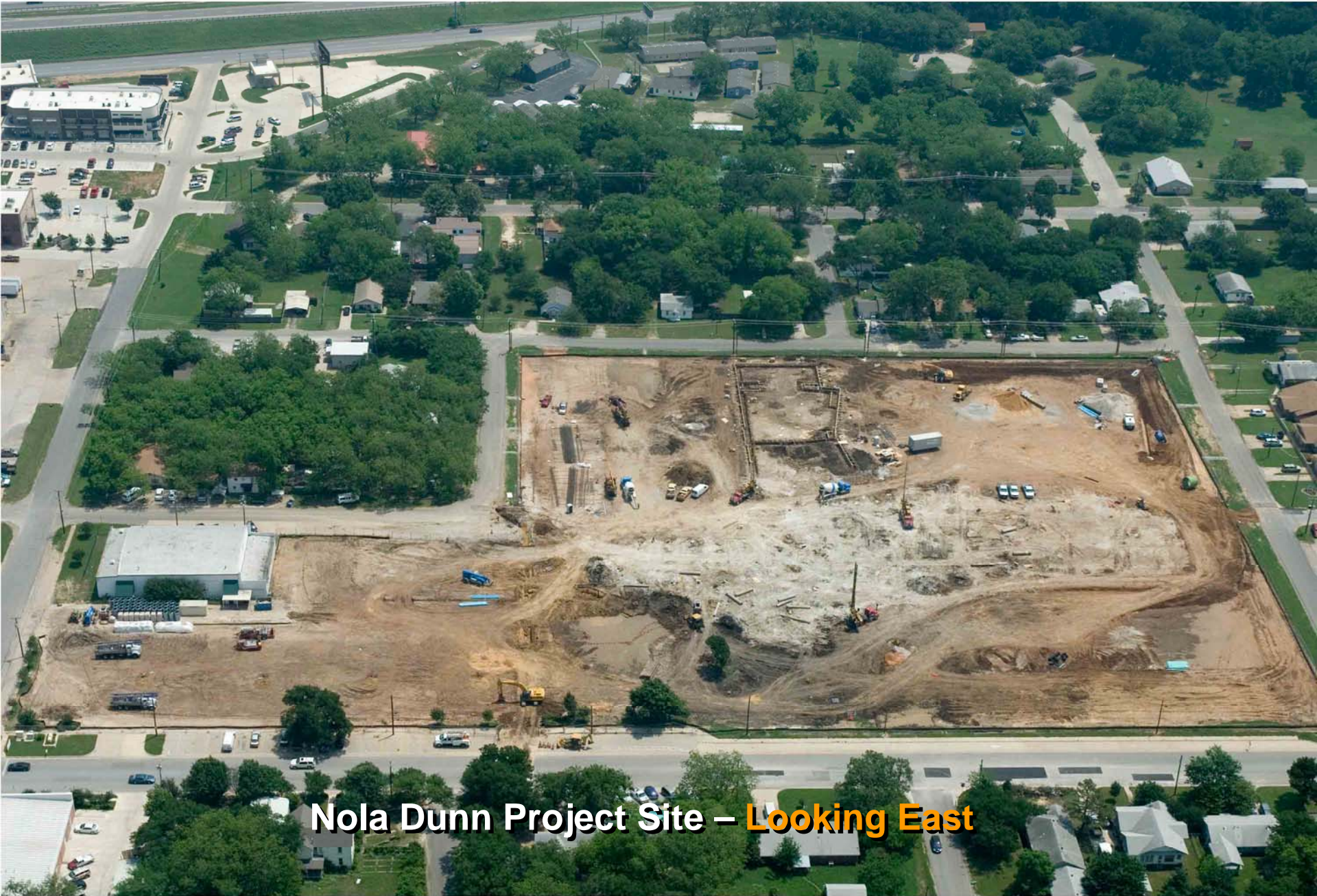
Nola Dunn Project Site – Looking East