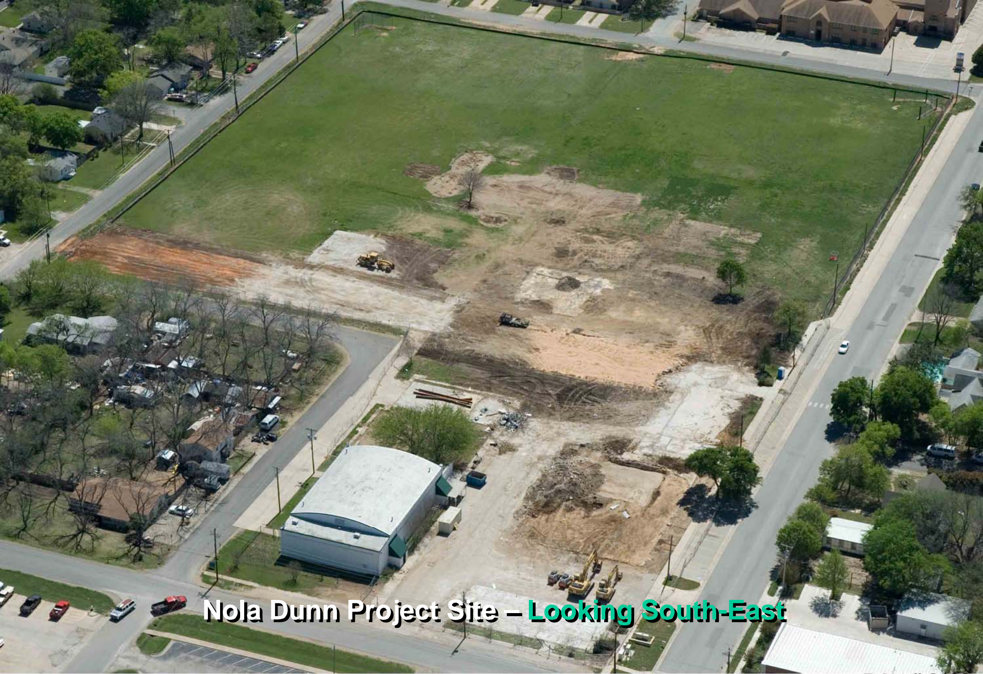
Nola Dunn Project Site – Looking South-East