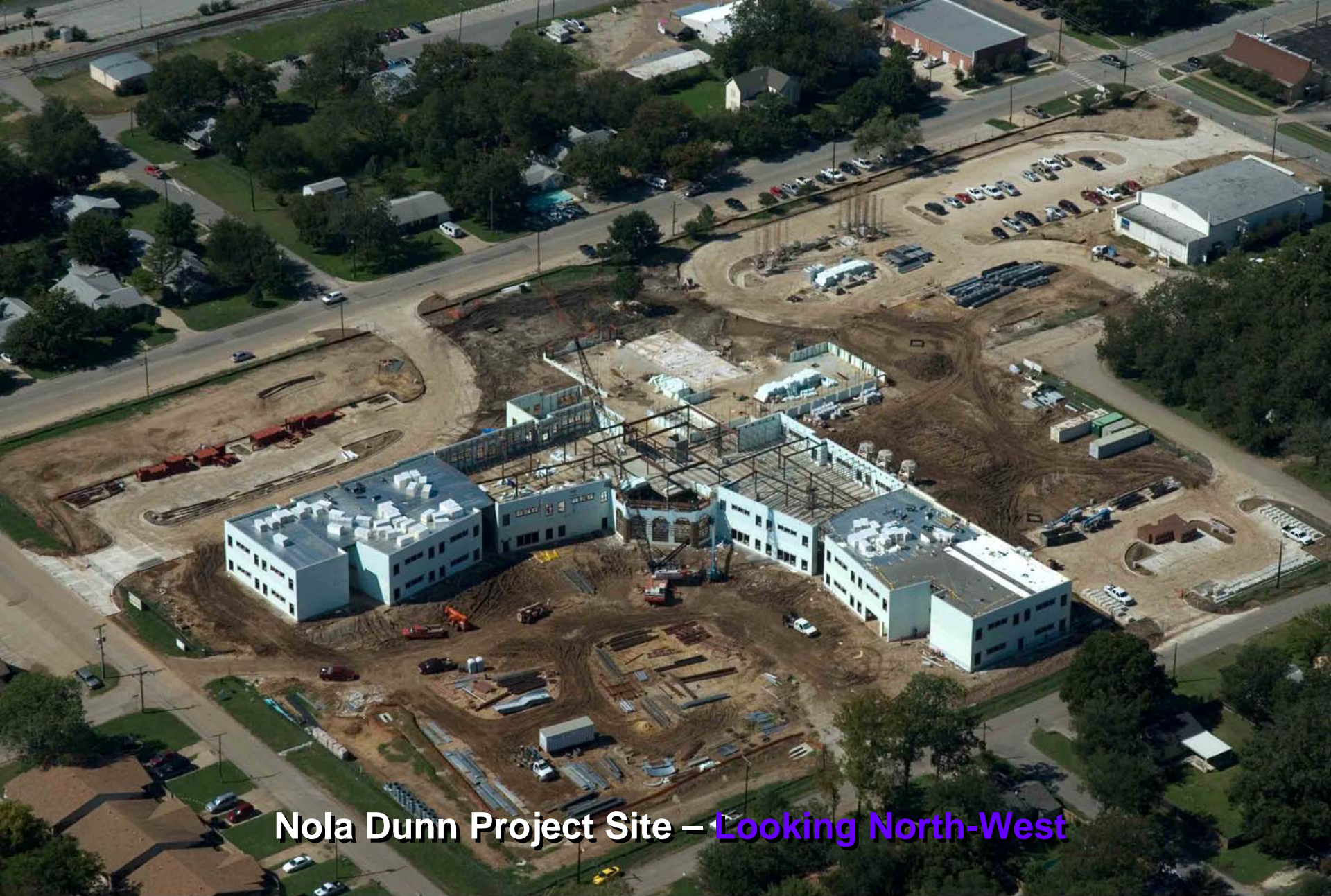
Nola Dunn Project Site – Looking North-West