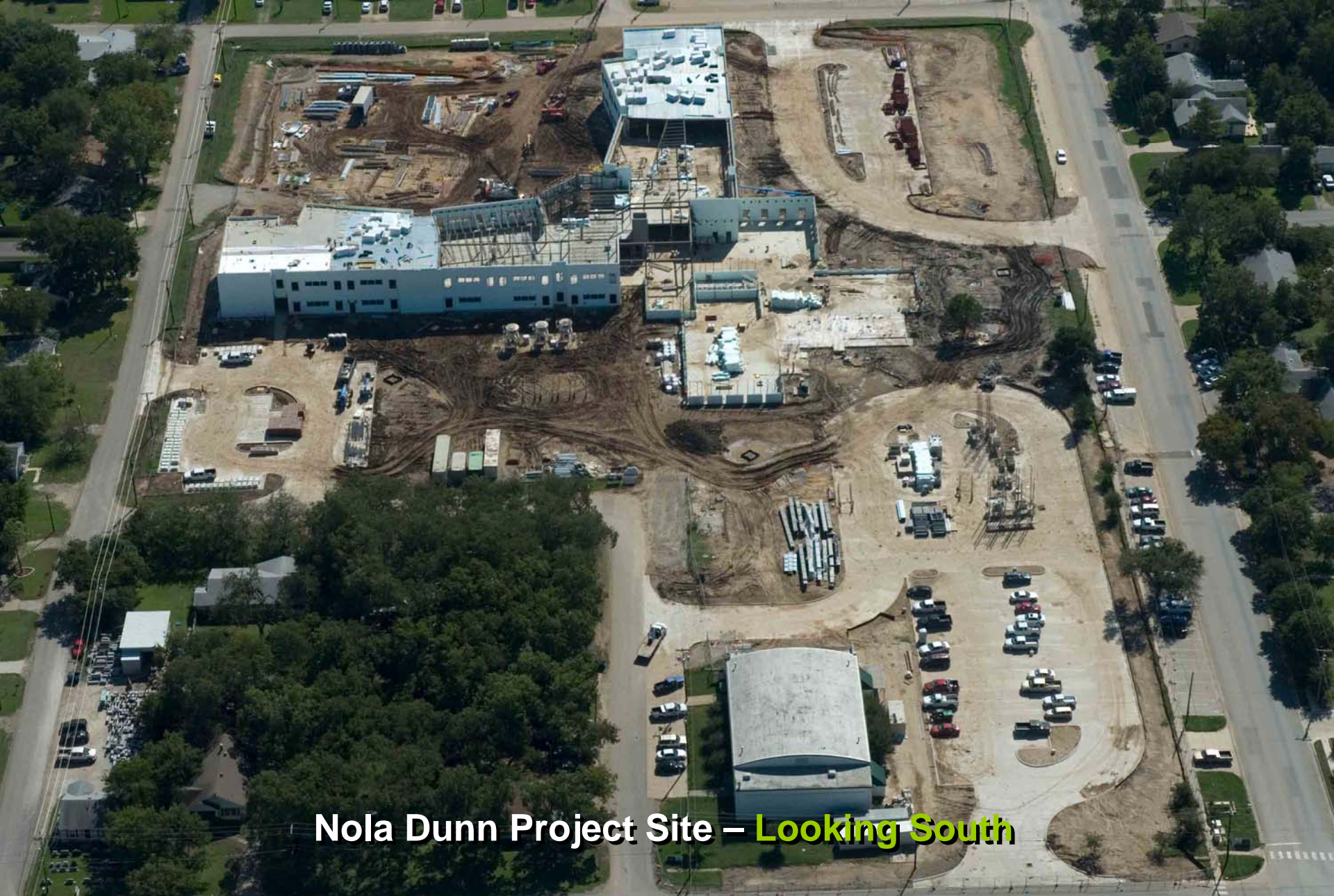
Nola Dunn Project Site – Looking South