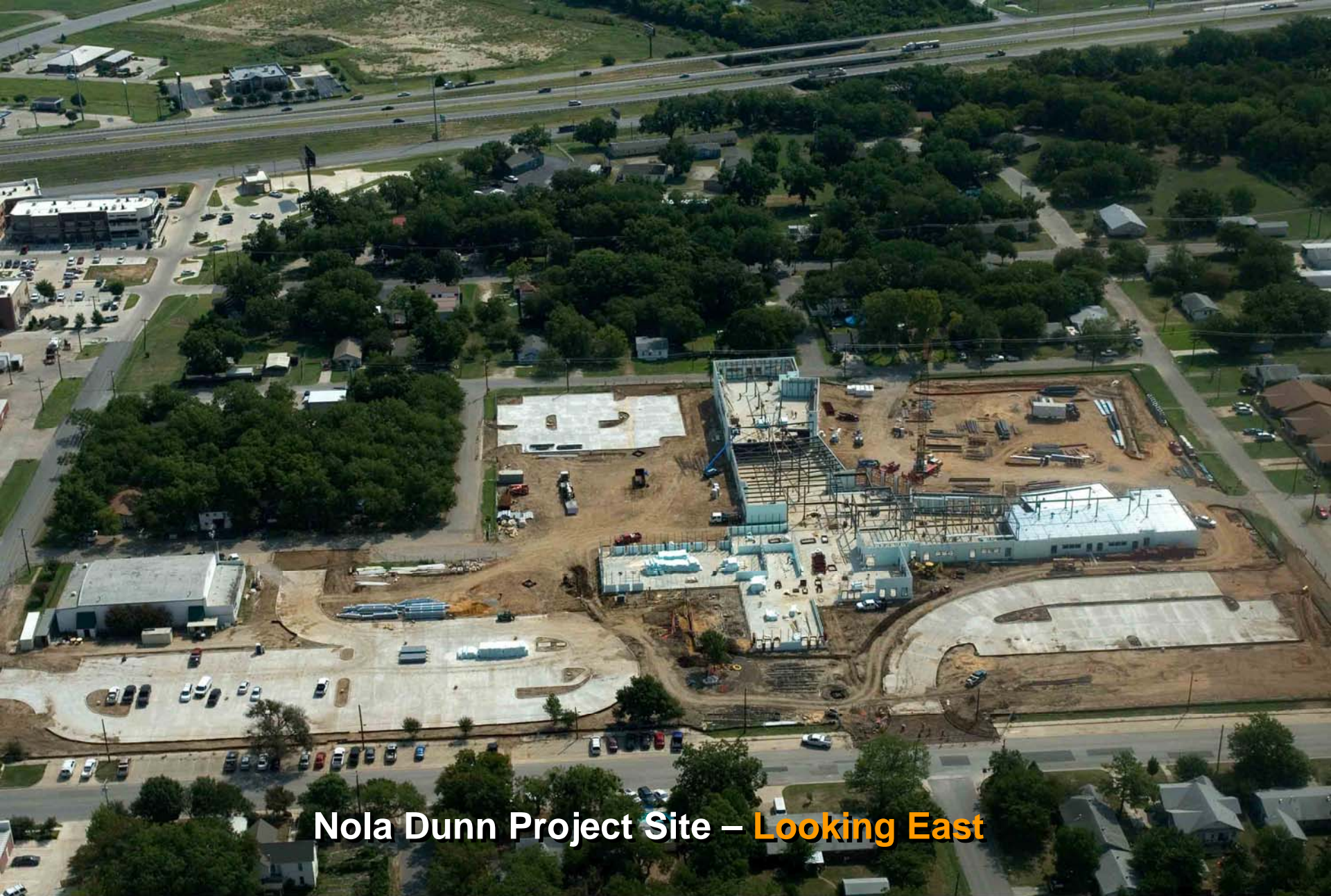
Nola Dunn Project Site – Looking East