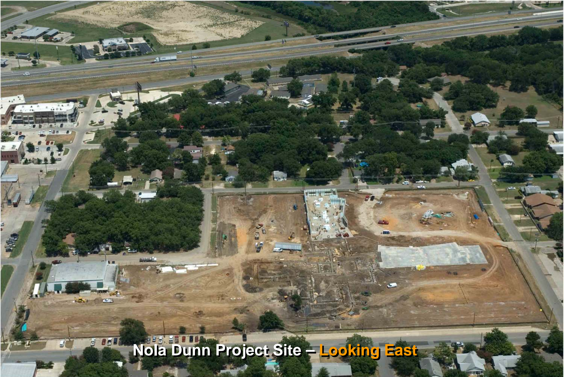
Nola Dunn Project Site – Looking East