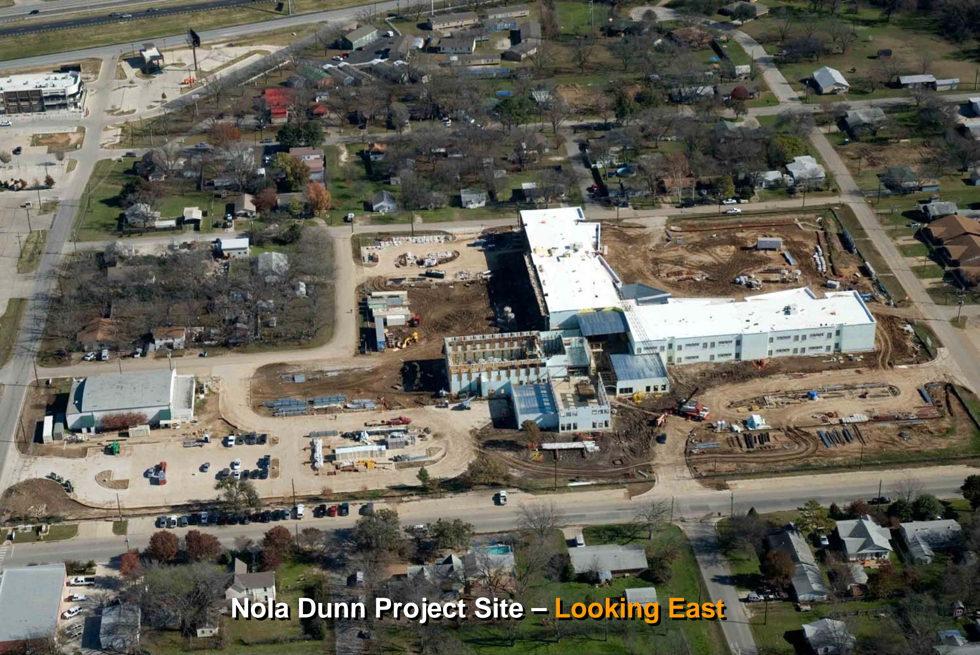
Nola Dunn Project Site – Looking East