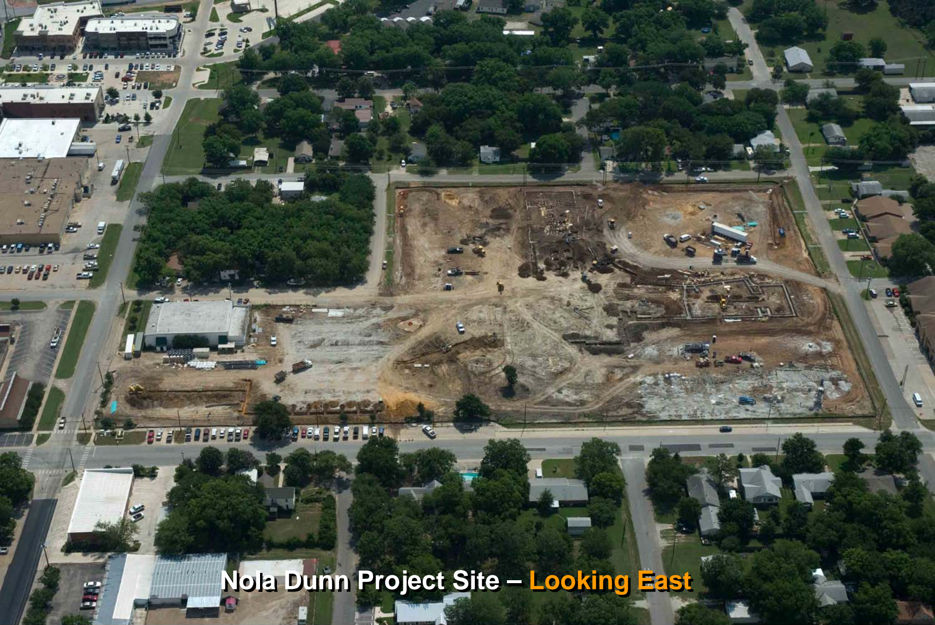
Nola Dunn Project Site – Looking East