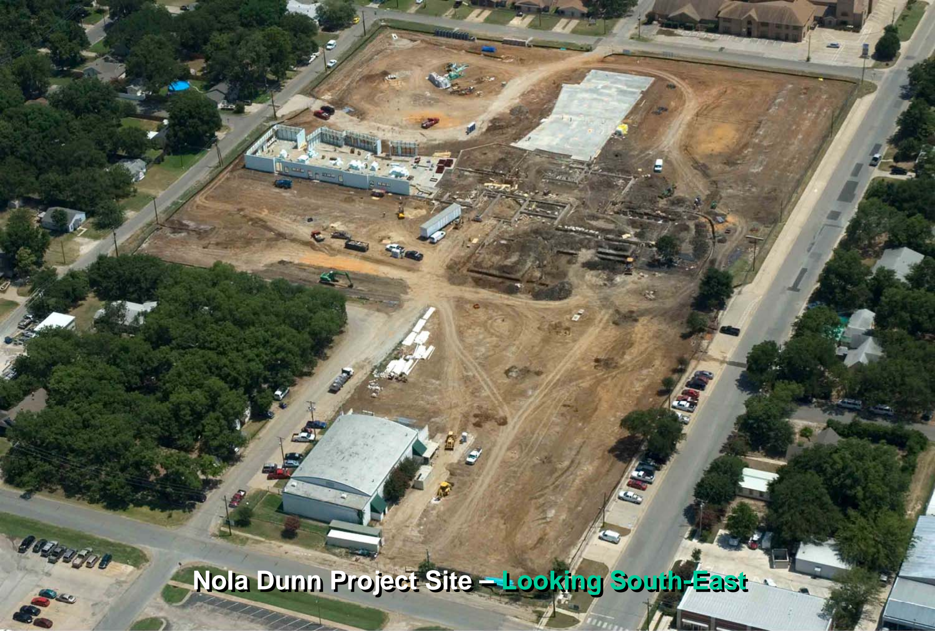
Nola Dunn Project Site - Looking South-East