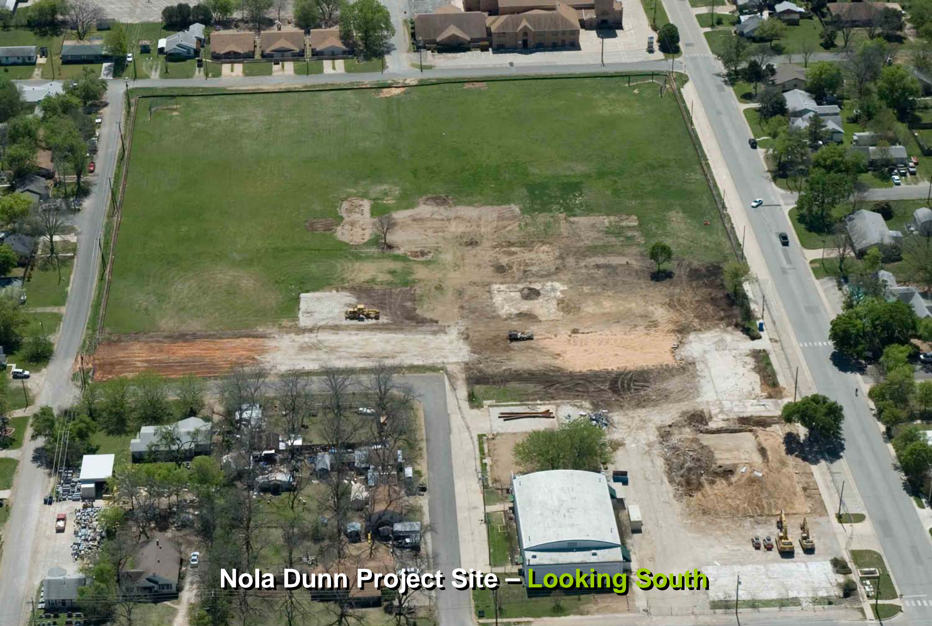
Nola Dunn Project Site – Looking South