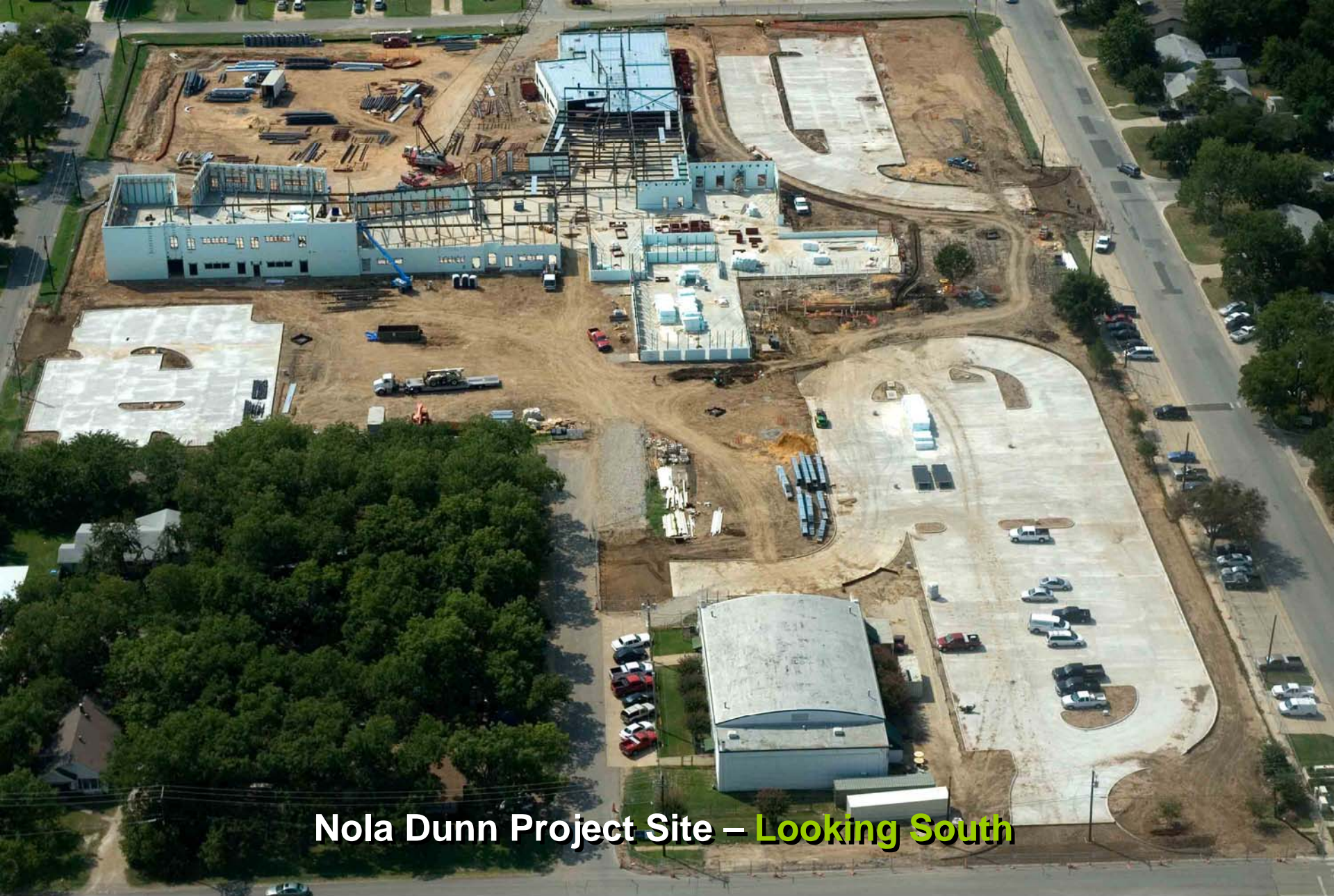
Nola Dunn Project Site – Looking South