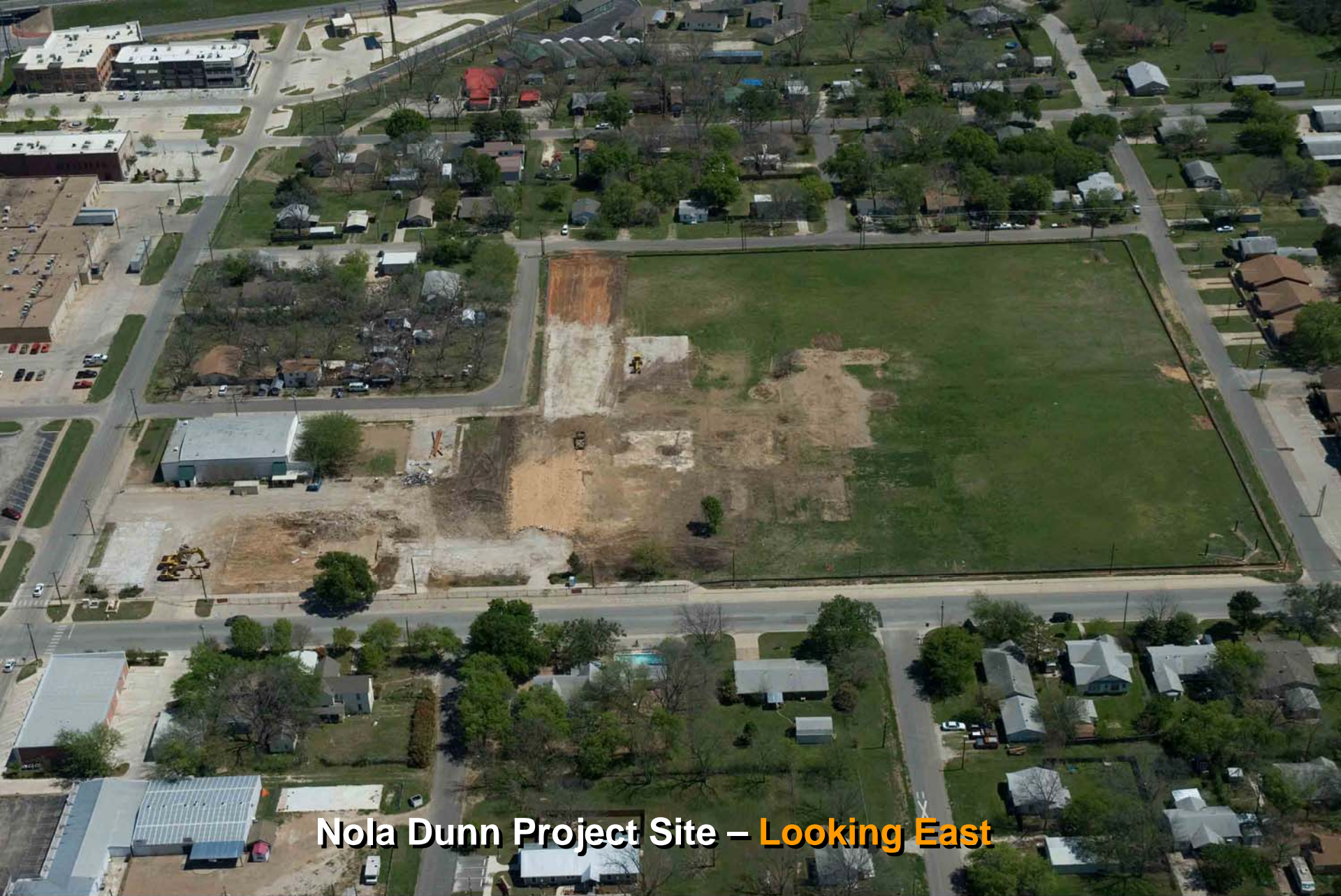
Nola Dunn Project Site – Looking East