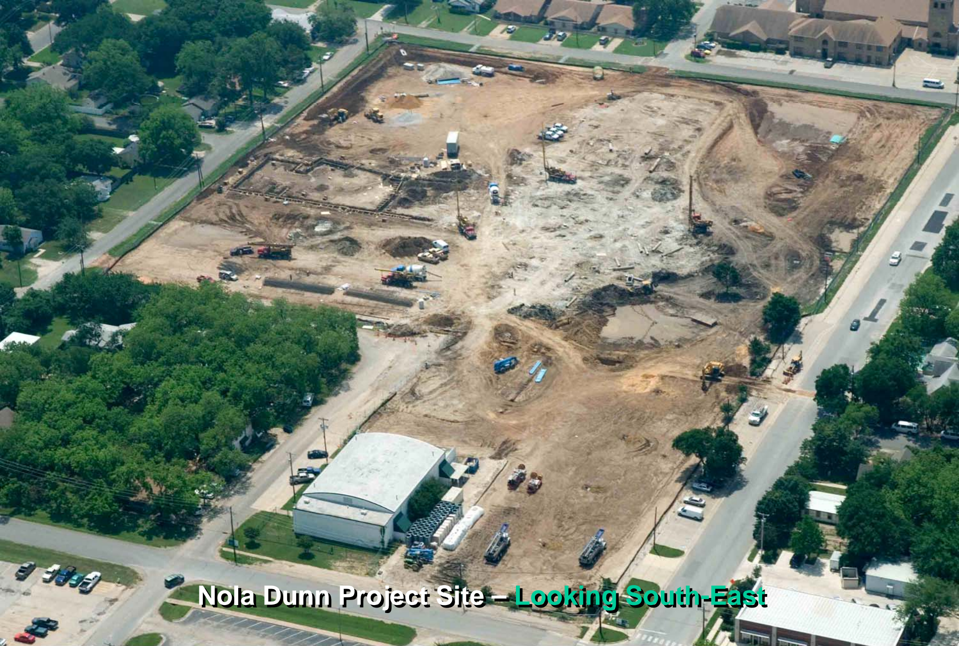
Nola Dunn Project Site – Looking South-East