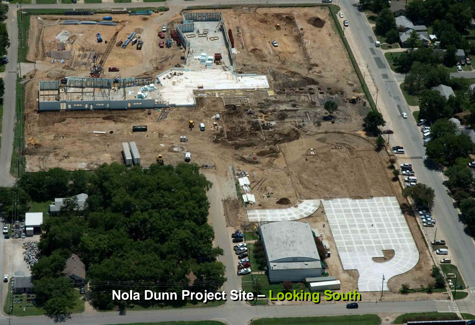
Nola Dunn Project Site – Looking South