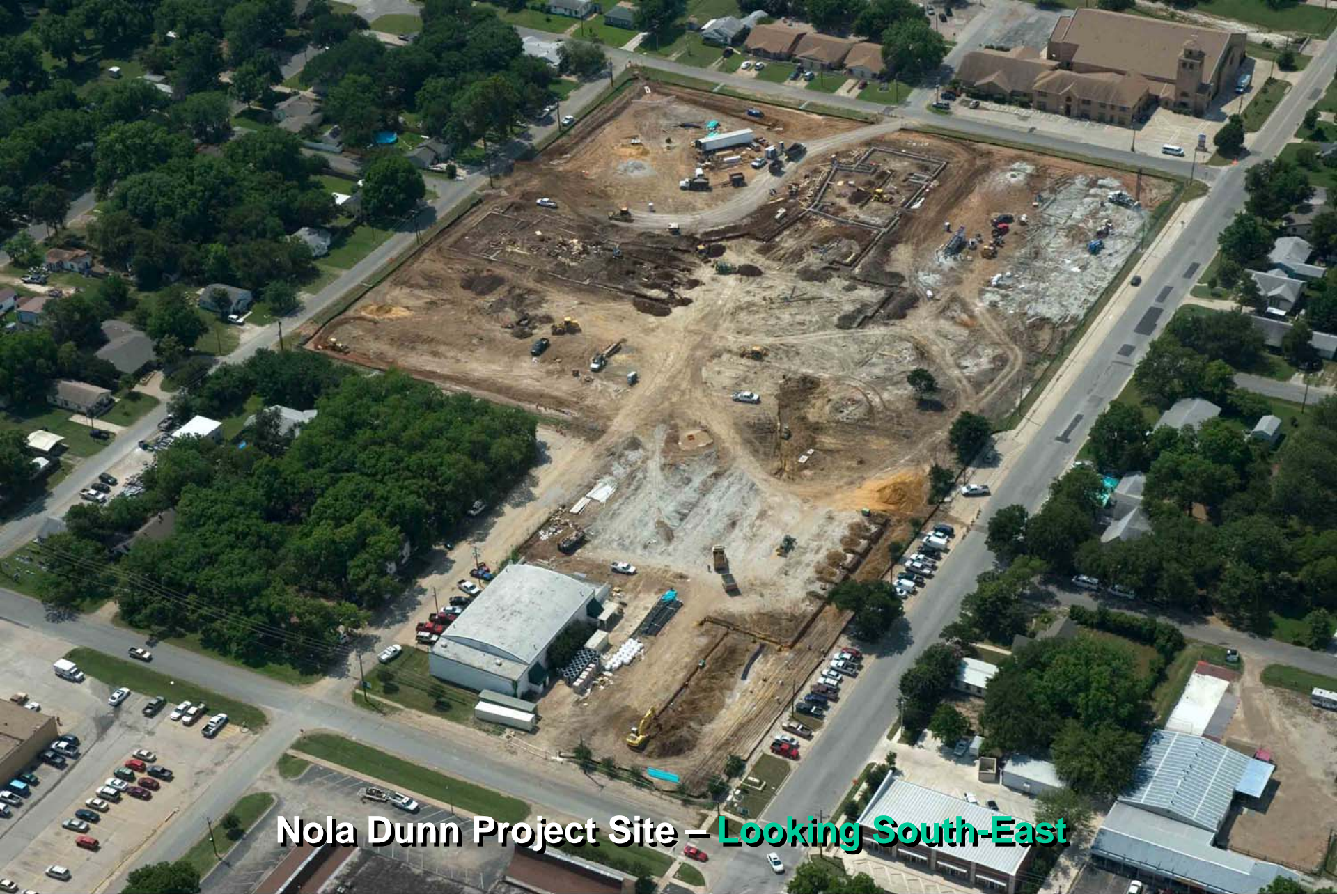
Nola Dunn Project Site – Looking South-East